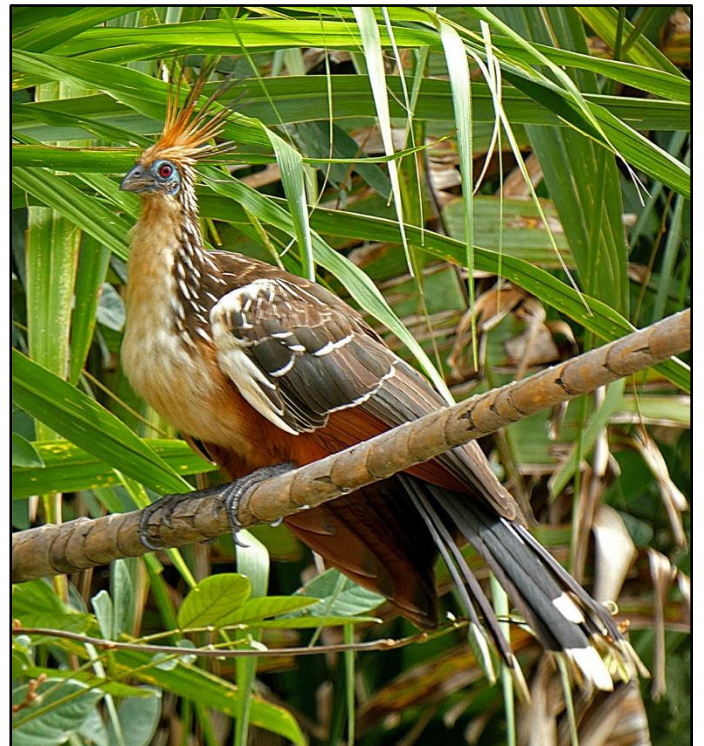
Hoatzin by Adam Green

The following morning, we were woken up by thunder and lightning — yikes! In our rain ponchos we left for the Rio Napo in the hope for some drier weather. Our tactic worked and when we reached the river islands the rain had eased significantly. We found lots of good birds including the amazing Horned Screamer — a true unicorn! The highly localized Black-and-white Antbird showed exceptionally well. We had great views of Ladder-tailed Nightjar and the Orange-backed Troupial