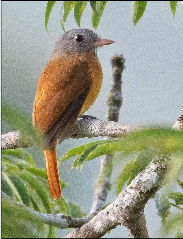
Citron-bellied Attila

Foothill Screech Owl refused to come out and remained heard-only.