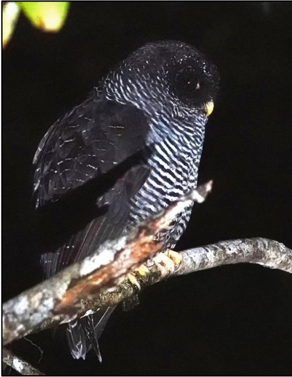
Black-banded Owl by Tom Jackman

Due to its diverse habitat array, ranging from the high Andes to excellent lowland rainforest, north-western South America has the highest avian diversity in the world. Ecuador is fortuitously situated within the heart of this fantastic ecological region, boasting a bird list of over 1,700 species! Furthermore, its small size, good infrastructure, unsurpassable scenery and friendly people make Ecuador one of the planet's most delightful birding destinations. In November of 2022, we birded the north of the country, first exploring the cloud forests and tropical foothills of the vast east-slope, and then descending into the mega-diverse Amazon basin of the Rio Napo region. The highlights of our epic jungle adventures are further narrated in this report.