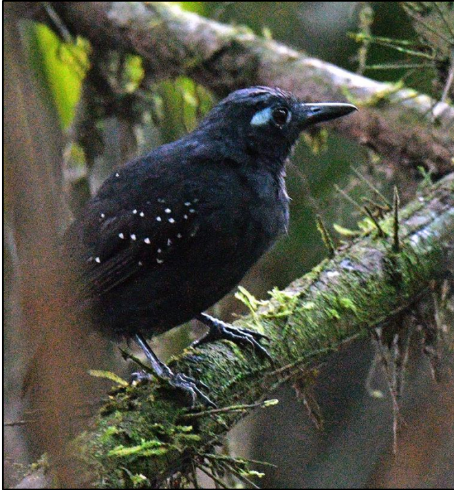
Plumbeous Antbird by Dennis Utterback

was awesome too. Unlike its name suggests, the Drab Water Tyrant was another favourite. At the community we enjoyed a local lunch with Chicha, Guayusa and barbeque grubs for some — delicious! The Yasuni trail in terra firme forest was challenging but rewarding with a small mixed-species flock yielding Cinereous and Dusky-throated Antshrikes and a male Long-winged Antwren. Red-throated Caracaras and Blue-capped Manakins were other highlights that we enjoyed. The rare Hairy-crested Antbird was singing at the edge of the trail but never came out for viewing. In turn, Sooty Antbird was briefly seen.