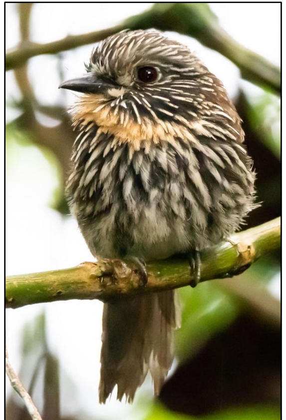
Black-streaked Puffbird by Astar Winoto

The following morning, we added Black-faced Antbird to the mix when checking the moth sheet for insectivorous birds. A Gorgeted Woodstar that was briefly foraging on verbena flowers was another addition to the list. We then birded the infamously steep Piha trail where we tracked down a bunch of rare species. We kicked off with a Brown Nunlet, soon followed by Large-headed Flatbill and Fulvous Shrike-Tanager. A fantastic Yellow-throated Spadebill popped up in the midstory providing us with superb views — a real cracker! Shortly after, we got our bins on another rarity — Grey-tailed Piha! After lunch, we connected sweetly with a male Fiery-throated Fruiteater. Our owling session was exciting with great views of Tropical Screech and Band-bellied Owls. A