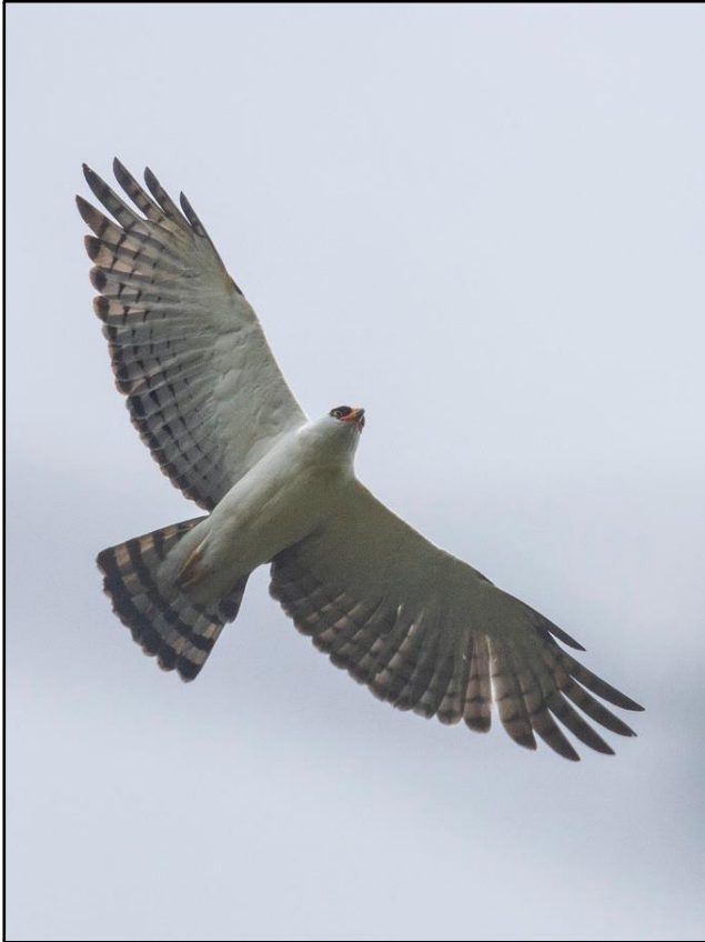
Black-and-white Hawk-Eagle by Dušan Brinkhuizen

produced many novelties, including Cliff Flycatcher, Fasciated Tiger Heron, White-capped Dipper and Chestnut-eared Aracari. Undoubtedly, our best bird was an adult Black-and-white Hawk-Eagle that flew low overhead, resulting in perfect views — a real cracker! At Wildsumaco Lodge we were welcomed by an overdose of hummingbirds at the feeders. Military Macaws flew by at the lodge deck and a fantastic Wattled Guan was posing for us in a fruiting Cecropia tree — a mega day with a total of 161 bird species recorded!