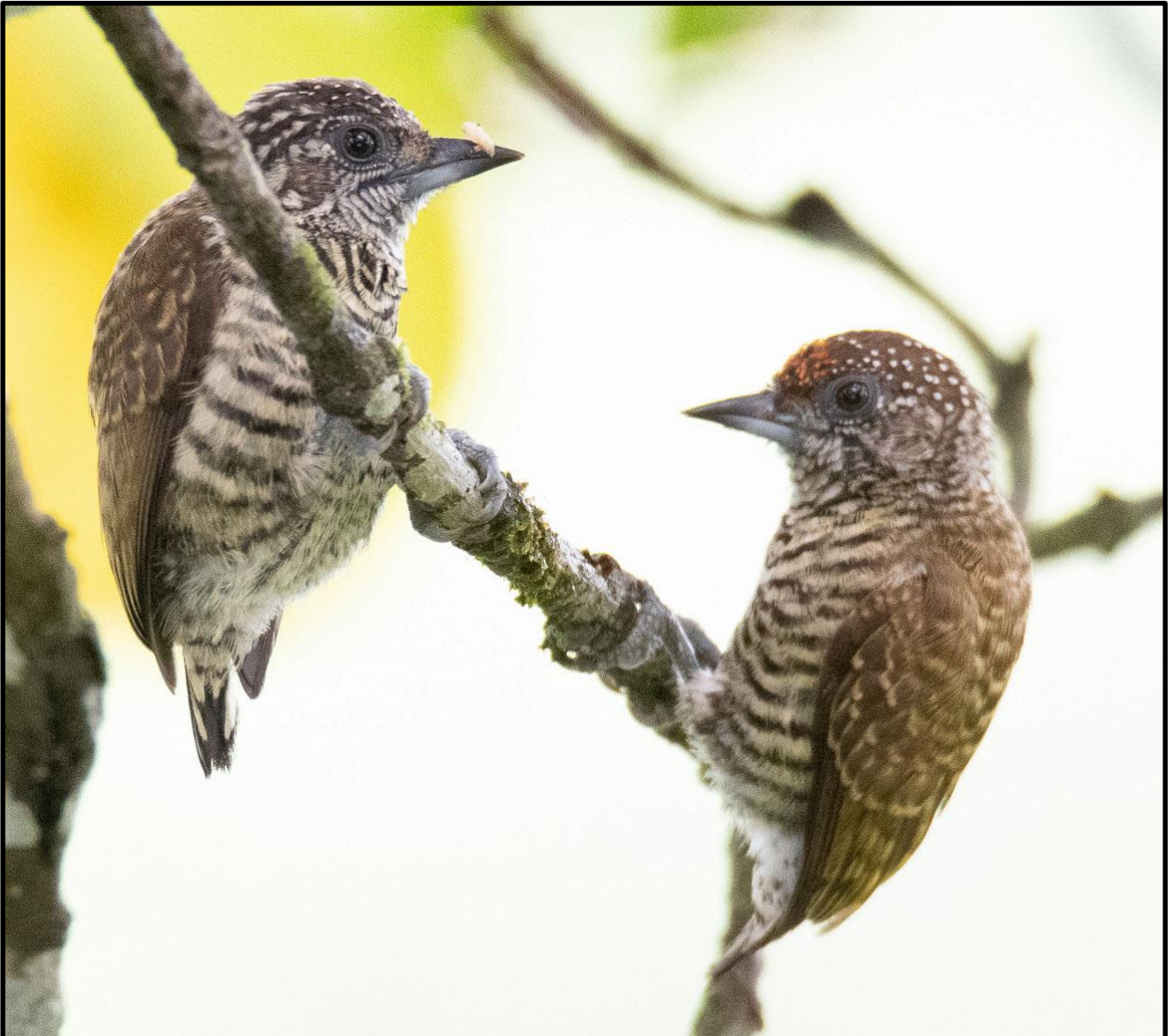
Lafresnaye's Piculet